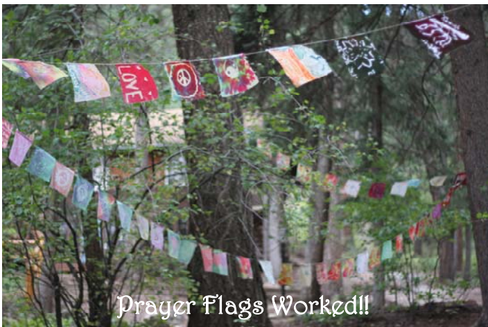
Prayer Flags Worked!!

Besides the Treehouse construction, the Marathon expansion was foremost on our mind, knowing it will bring a welcome and generous gathering place in inclement weather. One hurdle we were faced with was