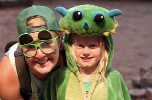
Jurassic Park is always a favorite Evening Play!