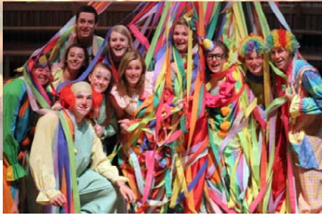
Trainees at circus