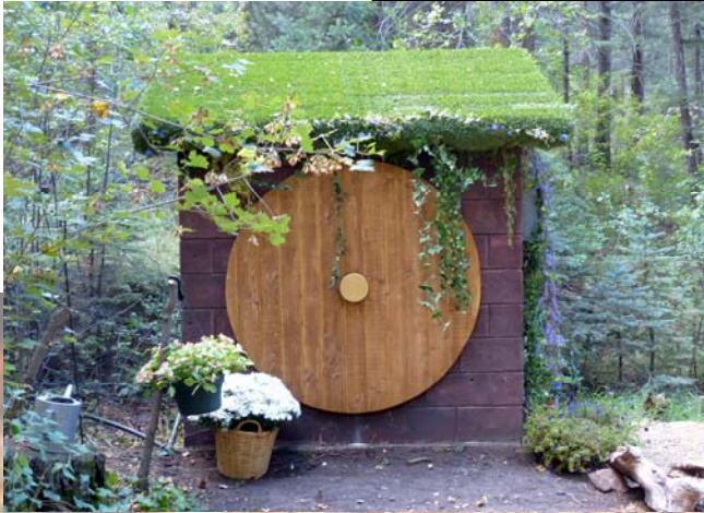
This old wellhouse (#1), which dates back to the early 60s was magically transformed to a Hobbit House! Its grassy roof, round door, and diminutive runes give it the aura of Frodo and his little pals! It is aptly set at the apex between the Fairy Garden, the Treehouse, and the Place of the Blue Spruce. A charming neighborhood!